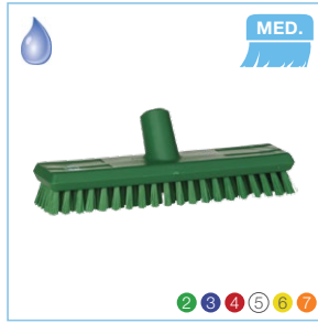
7041x Vikan Deck Scrub