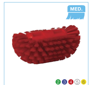
7039x Vikan Tank Brush