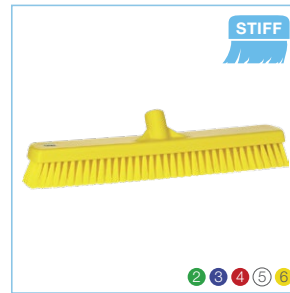
7062x Vikan 19" Deck Scrub