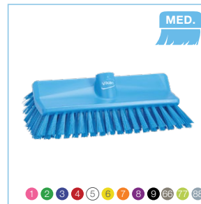
7047x Vikan High-Low Brush