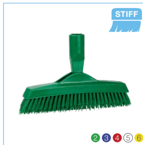
7040x Vikan Grout Brush