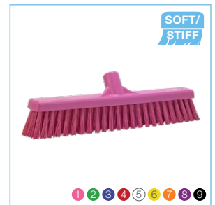
3174x Vikan 16" Combo Push Broom