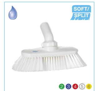
7067x Vikan Waterfed Washing Brush w/Angle Adjustment