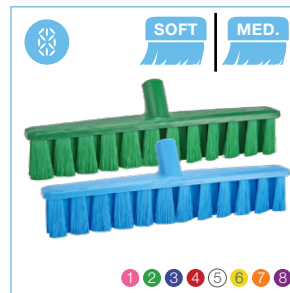
3171x | 3173x (Soft) (Medium) Vikan 16" UST Push Broom