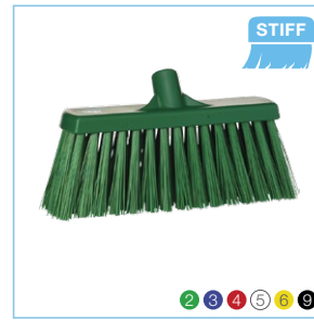
2915x Vikan 13" Push Broom