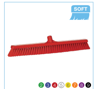
3199x Vikan 24" Small Particle Push Broom