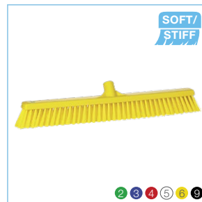
3194x Vikan 24" Combo Push Broom