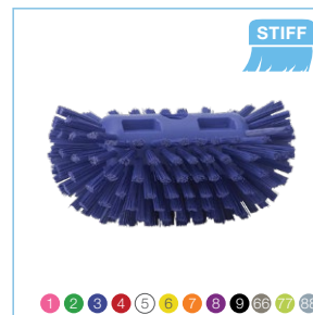
7037x Vikan Tank Brush