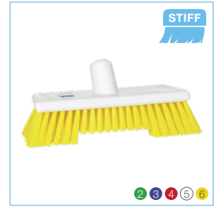
7044x Vikan Narrow Flared Deck Scrub