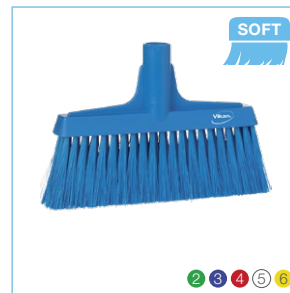
3104x Vikan 10" Upright Broom