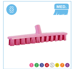
7064x Vikan 16" UST Deck Scrub