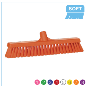
3179x Vikan 16" Small Particle Push Broom