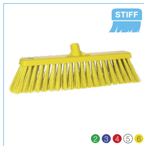
2920x Vikan 20" Push Broom