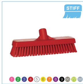
7060x Vikan 12" Deck Scrub