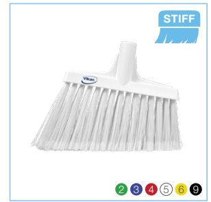
2916x Vikan Split-Bristle Angle Broom