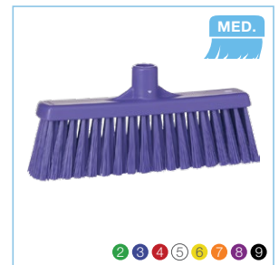
3166x Vikan 12" Upright Broom