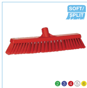
3178x Vikan 16" Fine Particle Push Broom