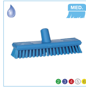
7043x Vikan Deck Scrub