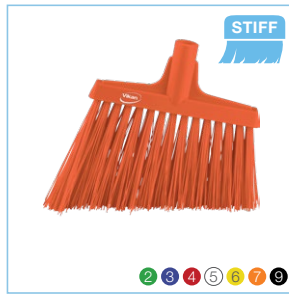
2914x Vikan Angle Broom